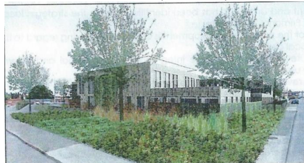
(This is an Artists impression of what the Primary Care Centre, was supposed to look like).

This Health Care facility is badly needed in